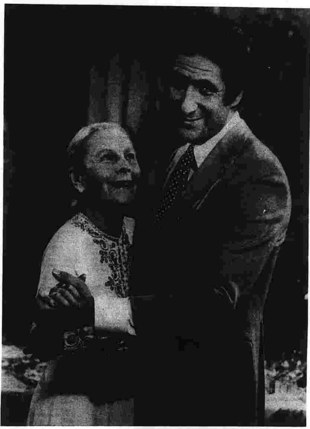
When Alex (Judd Hirsch) picks up an elderly passenger (Ruth Gordon) who likes to take expensive taxi tours of the city, he is showered with big tips and expensive presents in "Sugar Mama," on "Taxi," Tuesday, Jan. 16, on ABC.

Inside: Television Programs, Jan. 13 to 19