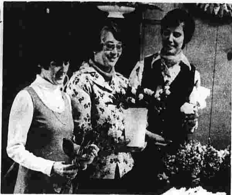
Flowers for Dinner-Dance